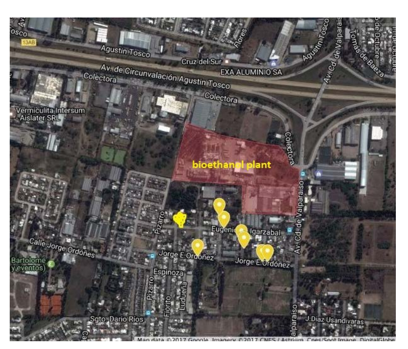
Figure 2. Spatial relation between households of neighbors featuring masses in upper airways and the bioethanol distillery.

There was a large group of asthmatic neighbors, especially the epidemiological reference group (children aged 6 and 7) whose use of bronchodilator inhalers was confirmed in more than one every two children (57%) while, as stated by the Global Asthma Network, the burden of asthma (measured as people using bronchodilator inhalers) in Argentina is 14% [7] [8]. Conjunctivitis cases were widespread (one every three residents). No national reference figures are available, but the American Optometric Association reports a 1.3% prevalence, same as the UK [9] [10]. The conjunctivitis cases found show no seasonal variations, as would happen with allergic conjunctivitis (the commonest among general population). Conversely, a typical evolution of chemical conjunctivitis was observed that people affected themselves to associate with the air pollution generated by the bioethanol plant, as they report not having suffered from this condition before 2012. Also suggestive was the fact that this epidemic conjunctivitis outburst coexisted with a case of conjunctival squamous cell carcinoma in a male neighbor who had previously had pink eye syndrome. The presence of persistent headache which, according to the WHO [4], affects a variable percentage between 1.7% and 4% of the world population, affected a fourth of the neighbors in the case under study. Notably, the affected people reported that when they